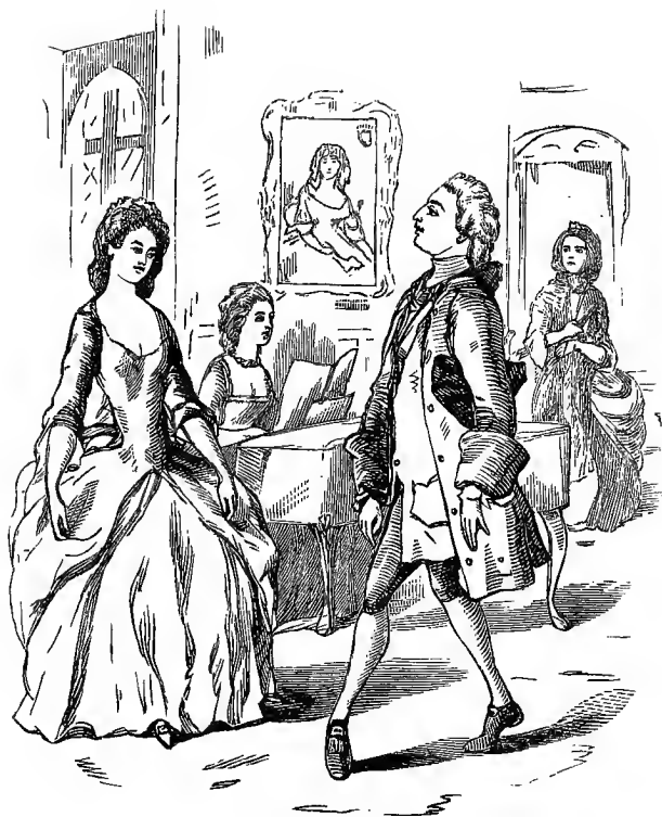
A Dancing Lesson.